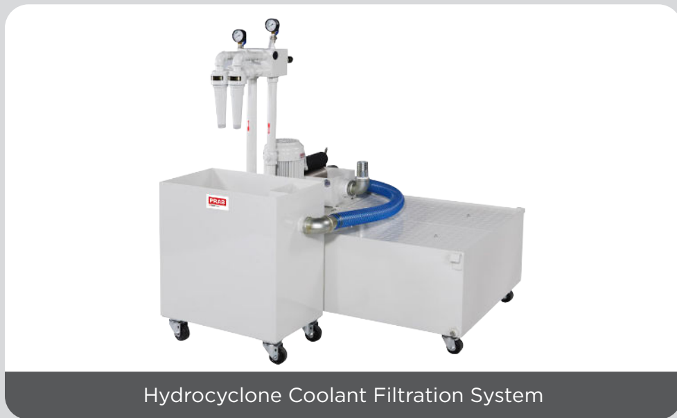
Hydrocyclone Coolant Filtration System

Replacing filter media is time-consuming and expensive. The Hydrocyclone creates ascending and descending vortexes in a cylindrical feed that separates contaminants from coolant without the use of filter media. This design results in consistent, long-term filtration.