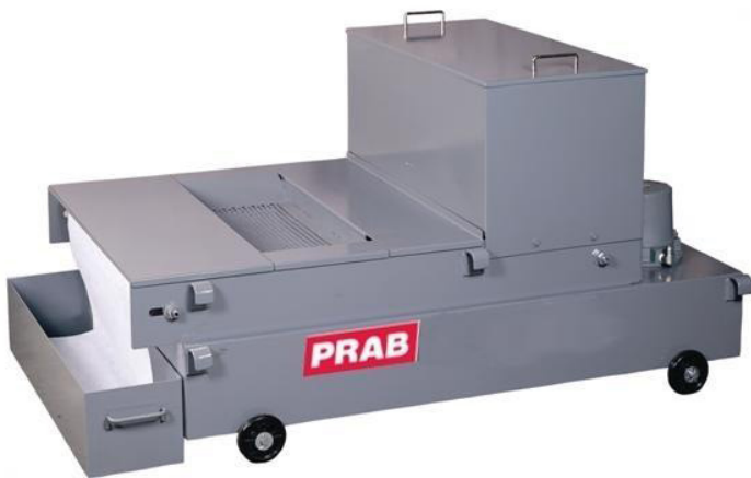
Standard Paper Bed Filter

PRAB offers a complete line of paper bed filters that provide long-term solutions for solids filtration, with or without magnetic separation- perfect for grinding applications. Filtered fluid can be reused or recycled, lowering your operational costs.