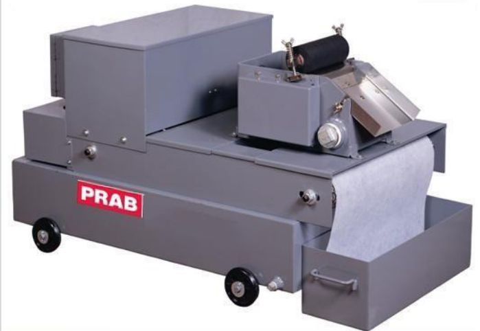
Magnetic Paper Bed Filter