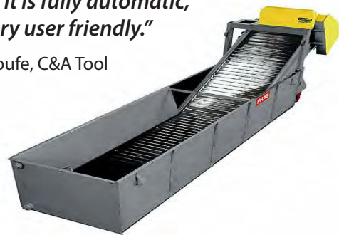
PRAB Quench Conveyor