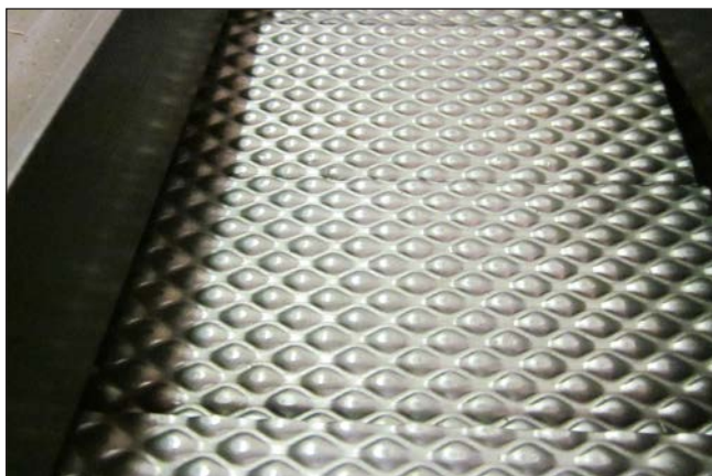
The Pivot Belt's Rigidized™, dimpled surfaces help eliminate carry-over