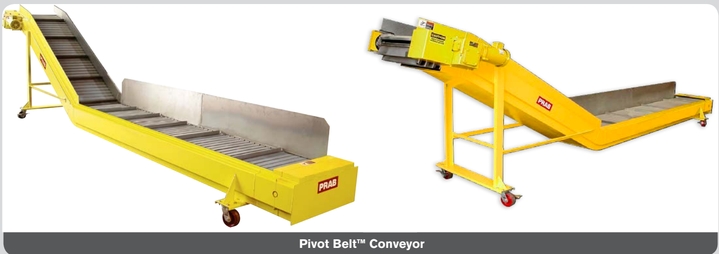
Pivot Belt™ Conveyor

PRAB's Pivot Belt™ Conveyor with Rigidized™ belt surface prevents scrap from sticking to the belt, while exclusively designed pivoting hinges flip scrap effortlessly into your hopper. Raised pusher flights keep material moving while the seamless, one-piece pan beneath, collects oily fluids to reduce housekeeping and keep workers safe and more productive.