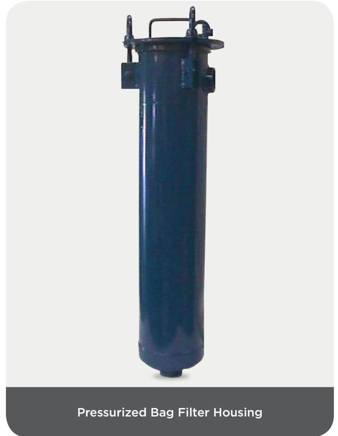
Pressurized Bag Filter Housing