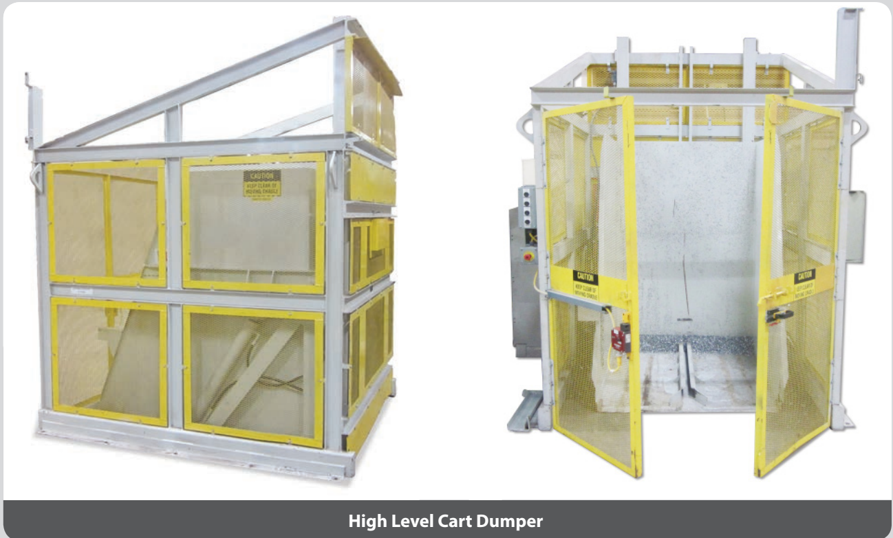
High Level Cart Dumper

Automatic dumpers are designed to accept chip carts or drums, elevate and invert them over a receiving hopper to feed a chip processing system.