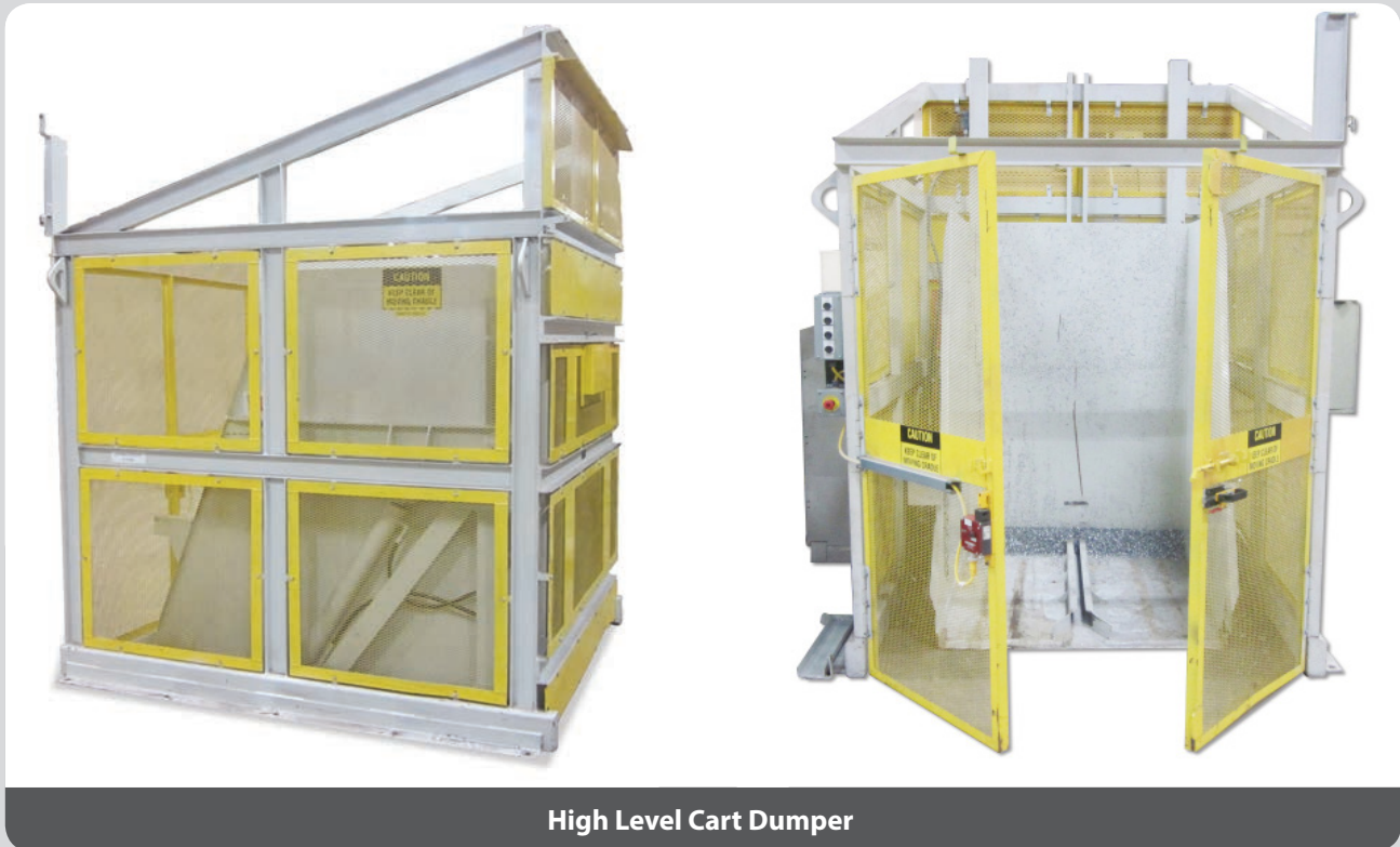
High Level Cart Dumper

Automatic dumpers are designed to accept chip carts or drums, elevate and invert them over a receiving hopper to feed a chip processing system.