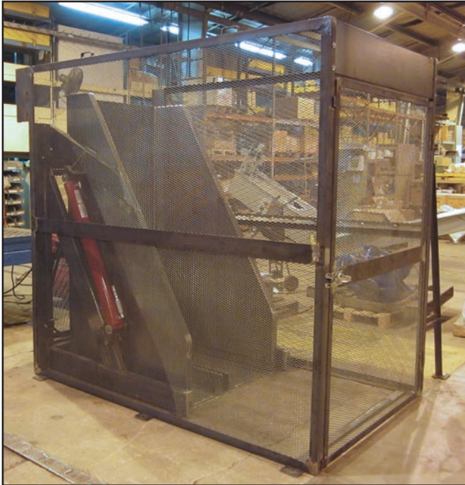
Low Level Cart Dumper