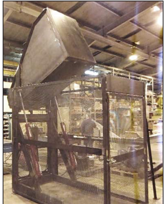
Cart Dumper Shown in Fully Inverted Position