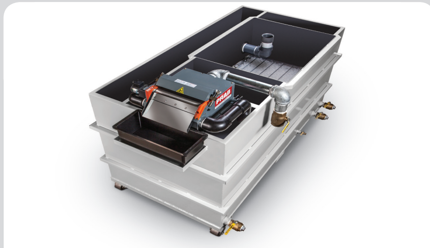
Tramp Oil Separator

PRAB Tramp Oil Separators use gravity flow and coalescence to remove free-floating and mechanically dispersed tramp oils, bacteria, slime, inverted emulsions, and more from individual machine sumps, central systems, and wash tanks. With a PRAB system you can cut new coolant purchases up to 75%, reduce your hazardous waste volumes up to 90%, and get a payback on your system in as little as 6-9 months.