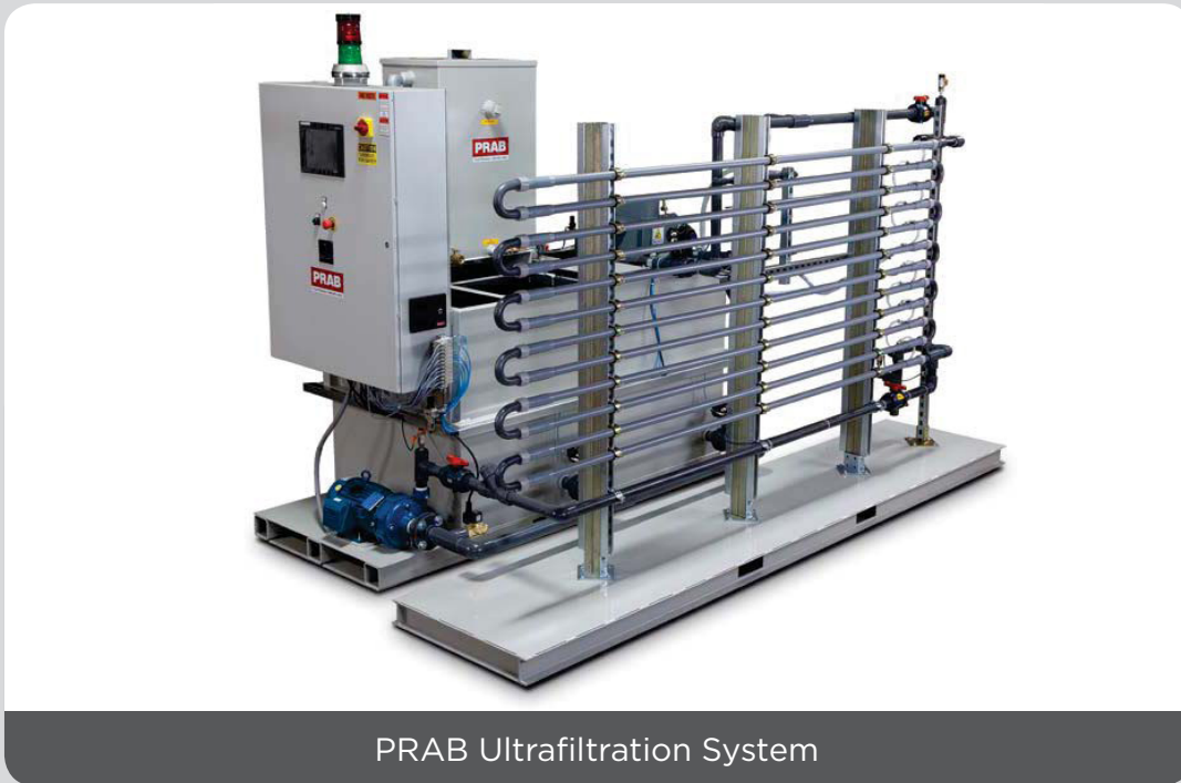
PRAB Ultrafiltration System

PRAB's line of Ultrafiltration Systems are designed to separate emulsified oils and suspended solids from wash water, rinse water, mop bucket, and floor scrubber waters to extend their useful life. You'll benefit from the reduction in the use of water and cost reduction of detergents by up to 75%, and reduce disposal costs as well.