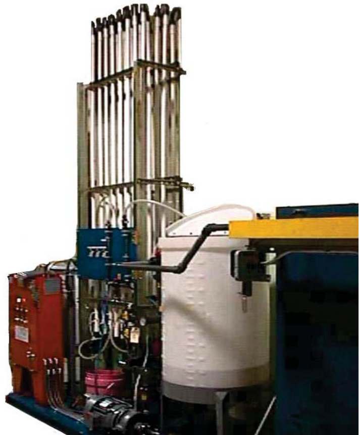
HTUF-24 1" Tubular Membrane

PRAB utilizes the latest and best-available technologies when designing ultrafiltration systems. Depending on the application, we will select hollow fiber, tubular, or other types of membranes.