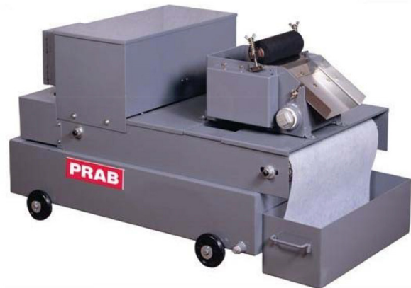
Magnetic Separator Mounted on Paper Bed Filter