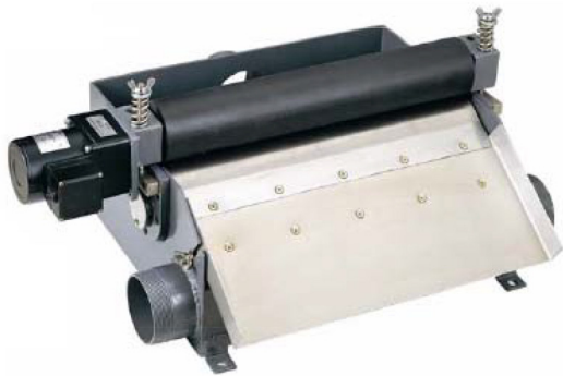
Model MSA: Rare Earth Magnetic Separator

PRAB MSA Magnetic Separators employ high-intensity rare earth magnets within a fully energized rotating drum to continuously remove ferrous particles from the flow of liquid. These systems are often used as a pre-filter to limit contaminants from reaching subsequent filtration equipment.