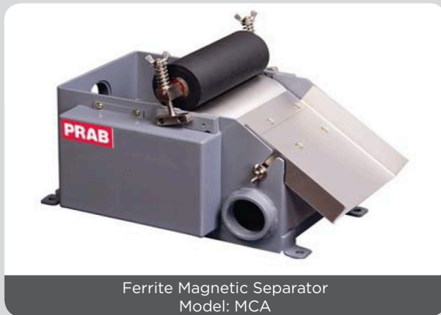
Ferrite Magnetic Separator Model: MCA

PRAB Magnetic Separators are available with either high-intensity Ferrite magnets or Rare Earth magnets. A fully energized rotating drum continuously removes ferrous particles from the flow of liquid. These systems are often used as a pre-filter to limit contaminants reaching subsequent filtration equipment.