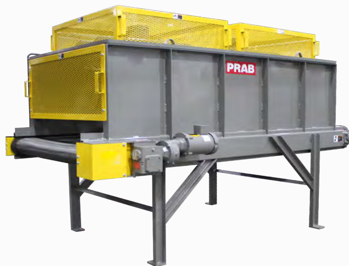
PRAB Casting Coolers

The PRAB Casting Cooler is used as an alternative for water quench conveyors and helps meet operational needs and improves plant air quality. Systems are available with single or multiple fan designs and can run continuously or indexing.