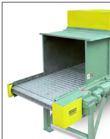
Perforated steel belt design for irregular shaped part profiles