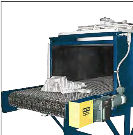
Flat wire mesh belt design promotes extra cooling for casting applications

The casting cooler pictured on the left was designed with multiple cooling zones and features a woven wire mesh belt design.