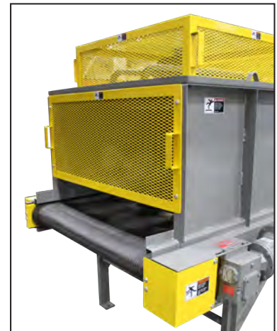
Woven wire mesh belt design for cooling of smaller components