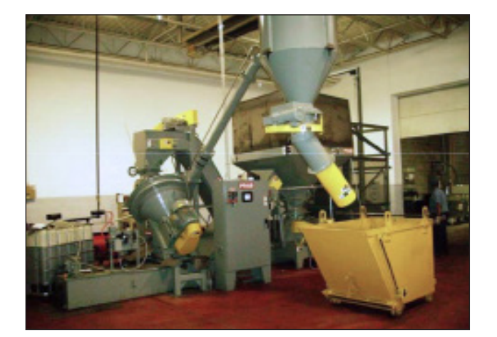
PRAB 24AD Wringer System (chips discharged to scrap cart)