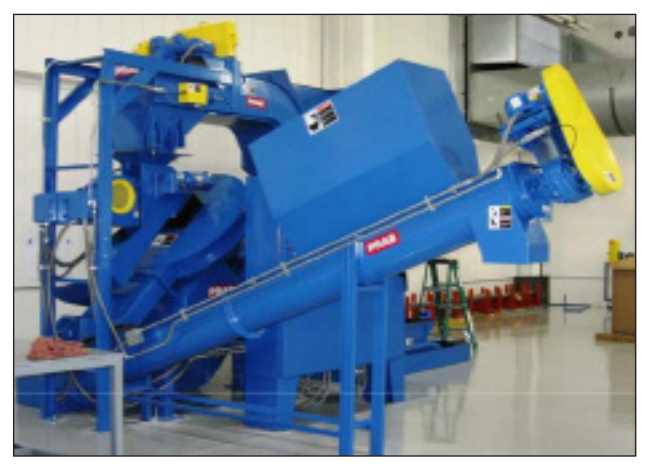
PRAB 24CD Wringer System (chips discharged to screw conveyor)