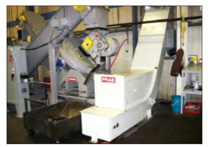
PRAB 24CD Wringer System (chips discharged to outdoor silo)