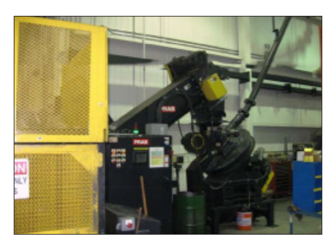
PRAB 24AD Wringer System (chips discharged to outdoor silo)