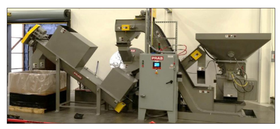
PRAB 24CD Crusher/Wringer System (chips discharged to screw conveyor)

Contact us to request a quote today Phone: 1-800-968-7722 | Email: sales@prab.com | Website: prab.com