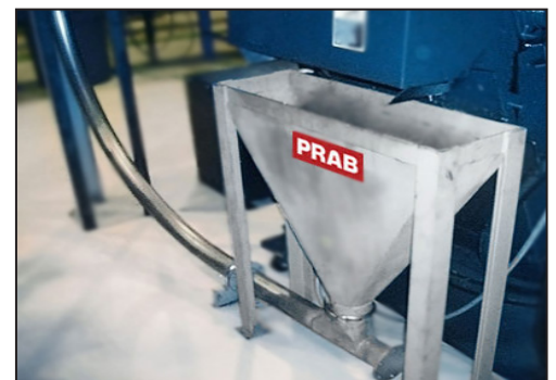
Typical chips and coolant inlet receiver hopper from CNC machine