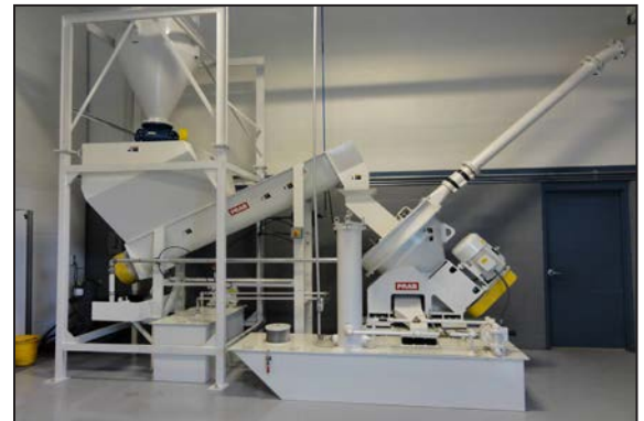
Pneumatic system feeds hopper to chip system and transports chips to outside silo