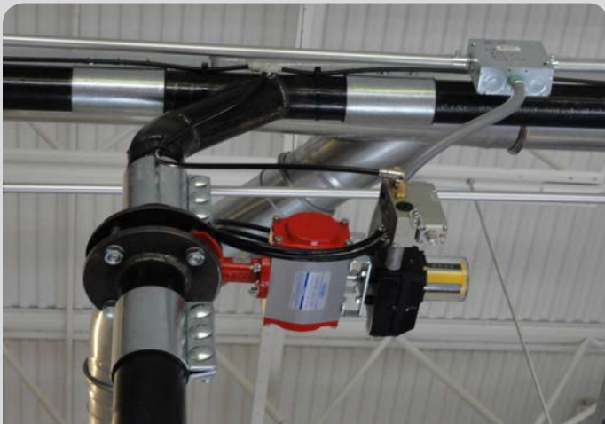
Overhead Pneumatic Piping

PRAB Pneumatic Conveyors offer operation and installation flexibility. This conveyor is designed to pick-up wet or dry scrap directly from CNC machining centers and transports it to a central chip processing system or load-out container. This type of tubular conveyance allows for installation near the ceiling or in tight spaces which provides minimal floor space for operation, and allows for easy reconfiguration when modifying plant space.