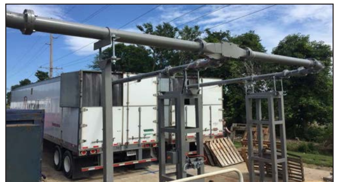
Pneumatic system discharge to semitrailers