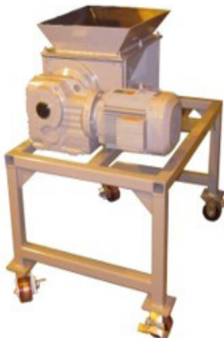
HAC as a stand alone unit