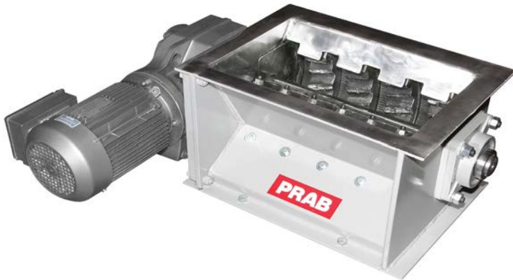
Horizontal Axis Crusher (HAC)

The PRAB Horizontal Axis Crusher (HAC) processes low volumes of stringy and bulky metal turnings into flowable shovel-grade chips at the source of generation. Engineered for on site maintenance with all wear parts being easily replaceable, including rotating cutter blades, stationary cutter rings and abrasion resistant discharge screen. The HAC system is typically mounted on a stand or heavy-duty cart under the discharge of a conveyor off the machining center.